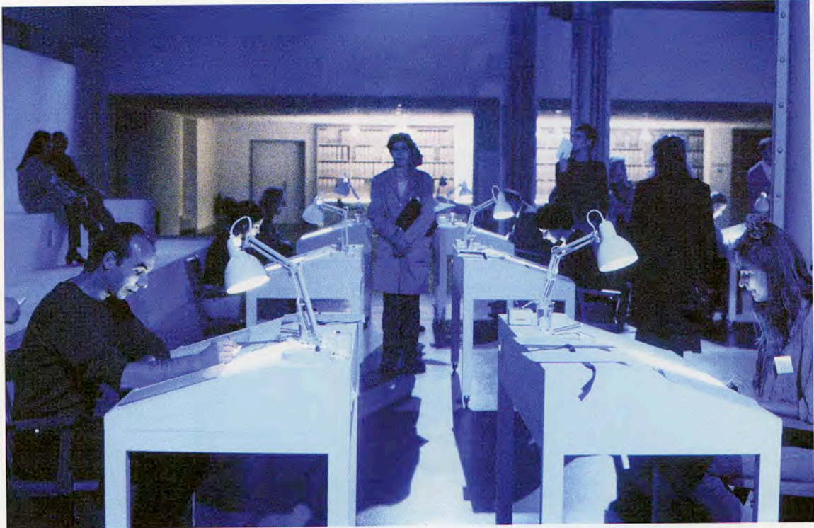
Arnold Dreyblatt, 'The Reading Room', 2001, furniture, projections, misc. materials; variable room installation and performance; -courtesy Kornhaus, Bern, photograph Arnold Dreyblatt.

solidity contrasts with the ephemerality of the installation and the endless repetition of the reading process, which the piece initiates.