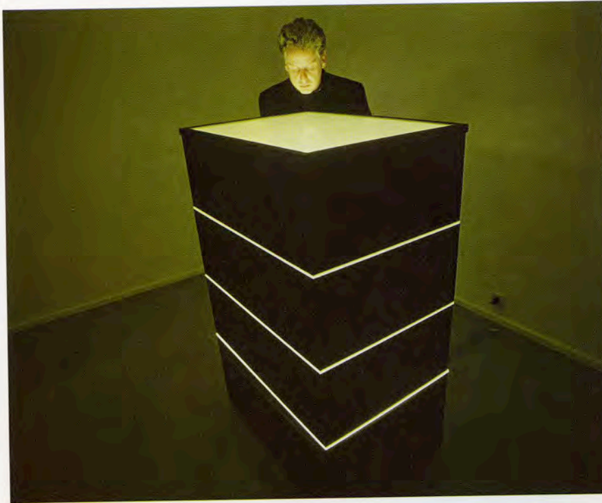
Left: Arnold Dreyblatt, 'The Great Archive', 1992, lightbox, Plexiglass, text folio, 130x60x82cm, courtesy Galerie Ozwei, Berlin; photograph Giacomo Oteri. Right: Arnold Dreyblatt, 'T-Docs', 1992, 82 A4 documents in hanging plastic envelopes; courtesy Galerie Ozwei, Berlin; photograph Giacomo Oteri.